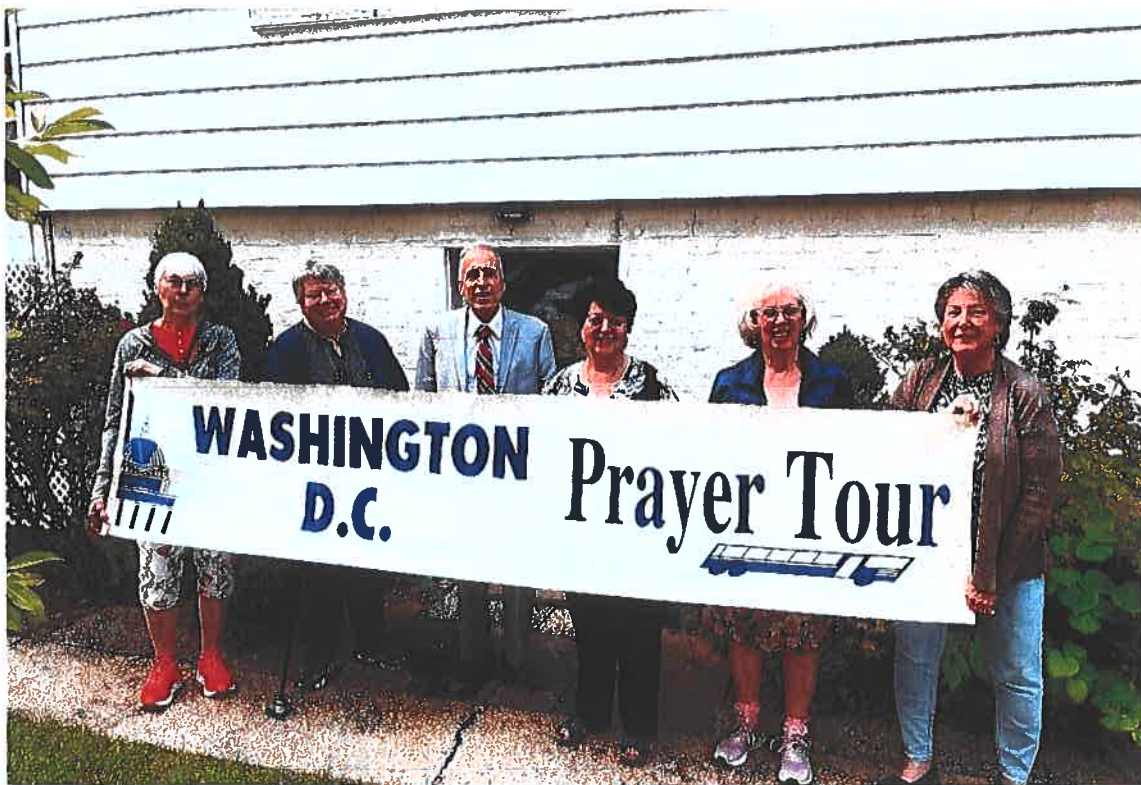
More Washington, D.C. Prayer Tours with Aglow U.S. Regional Prayer Teams in 2023: (TOP) MAY 7 Northeast states (BOTTOM) JUNE 29 Central States (CO & KS). (see previous page)