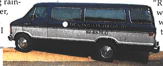
"Prayer Tours" drive cars, vans and buses of praying people past the White House, Lincoln Memorial, Embassy Row and other visual reminders to pray for national leaders.

The mission of the Prayer Embassy is to help Christians pray for nations,